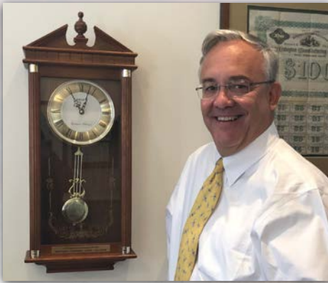
CFRBA Board Chairman 2011-2018