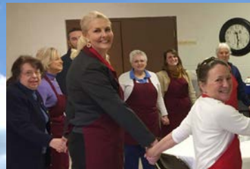
The Community Table

*Establishing an endowment fund requires a minimum of $10,000. We enable you to create an endowment fund using a wide variety of gift techniques, such as those shown on the following page. There are no set-up fees, and it can be done quickly using a simple fund agreement. The Foundation does charge a modest annual charge to administer a fund and support its work in the community. We always encourage you to discuss these ideas with your attorney, accountant, or other professional advisor, as this information is not intended as legal advice.