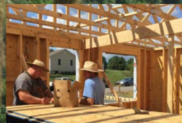
Rockbridge Area Habitat for Humanity