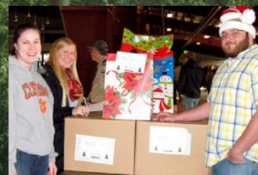
Rockbridge Christmas Baskets