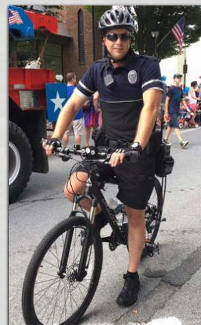
Scenes from Rockbridge Area Hospice and Lexington Police Foundation