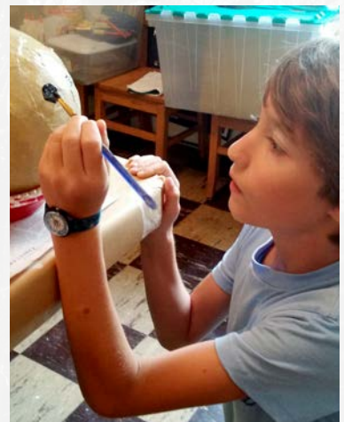
Fine Arts of Rockbridge