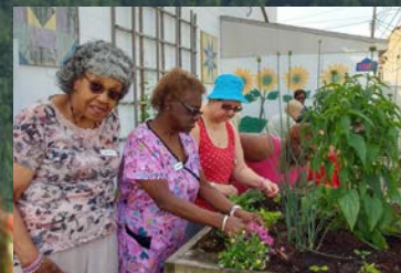
Maury River Senior Center