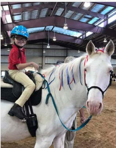
Hoofbeats Therapeutic Riding Center