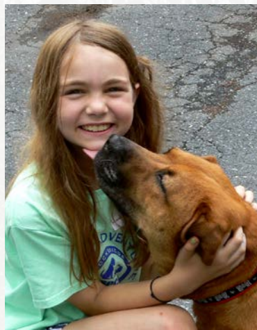
Rockbridge Area SPCA