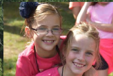
Camp Mont Shenandoah