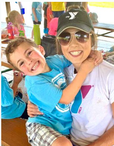
Rockbridge Area YMCA