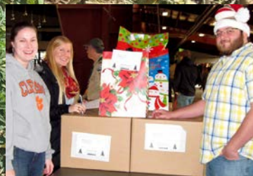
Rockbridge Christmas Baskets