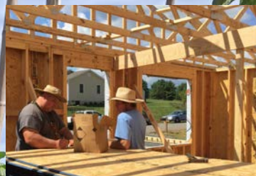
Rockbridge Area Habitat for Humanity

*Establishing an endowment fund requires a minimum of $10,000. We enable you to create an endowment fund using a wide variety of gift techniques, such as those shown on the following page. There are no set-up fees, and it can be done quickly using a simple fund agreement. The Foundation does charge a modest annual charge to administer a fund and support its work in the community. We always encourage you to discuss these ideas with your attorney, accountant, or other professional advisor, as this information is not intended as legal advice.