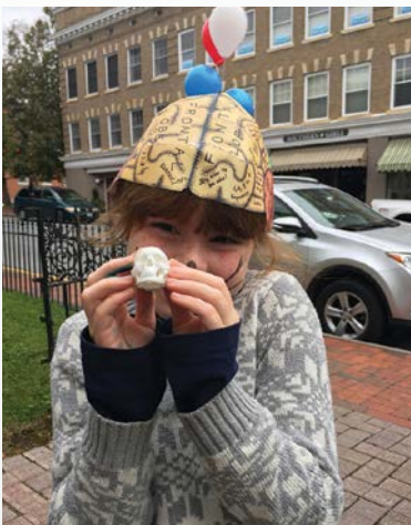
Main Street Lexington Science Festival