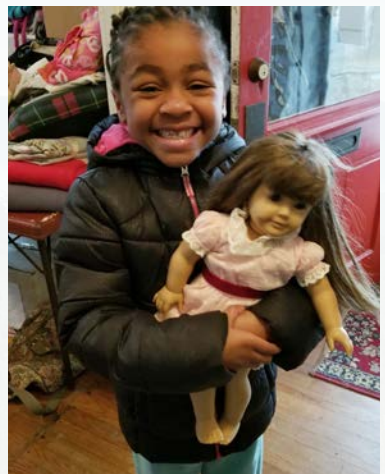
The Community Closet