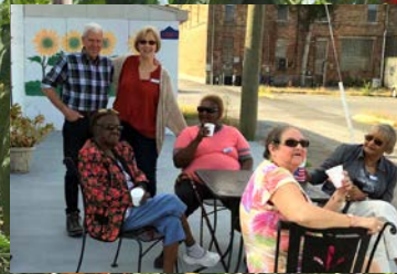
Maury River Senior Center