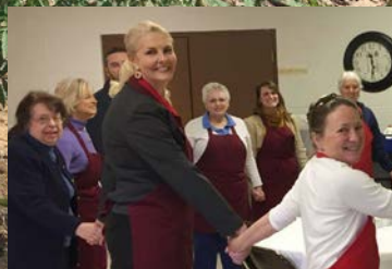
The Community Table