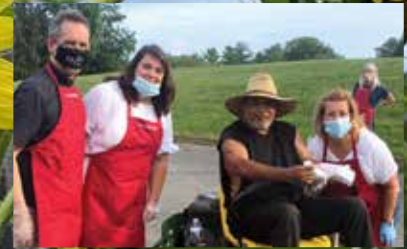
The Community Table