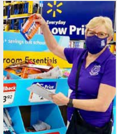
Lexington Woman's Club