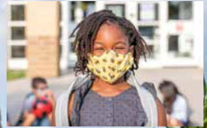
Rockbridge Area YMCA