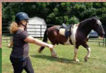
Hoofbeats Therapeutic Riding Center