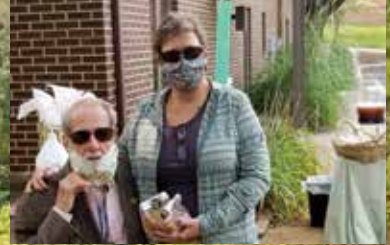
Rockbridge Area Hospice