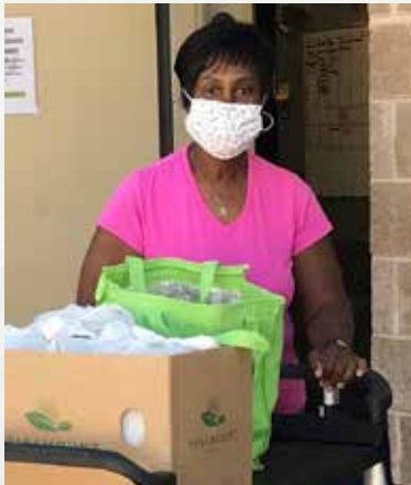
Meals On Wheels