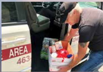
Rockbridge Area Transportation System