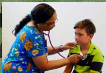
Rockbridge Area Health Center