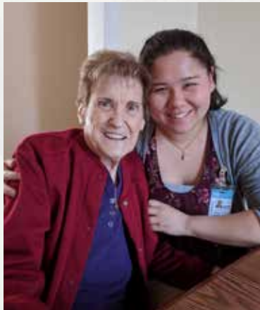
Rockbridge Area Hospice