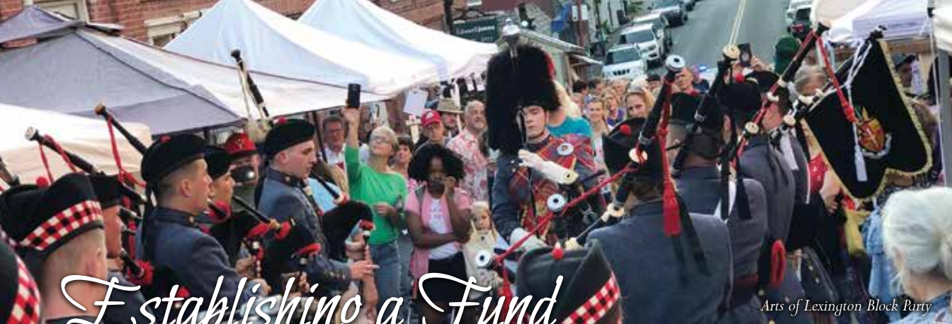
Arts of Lexington Block Party