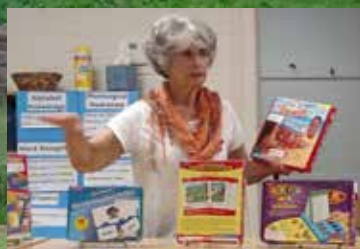
Rockbridge Regional Library