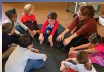
Yellow Brick Road

*Establishing an endowment fund requires a minimum of $10,000. We enable you to create an endowment fund using a wide variety of gift techniques. There are no set-up fees, and it can be done quickly using a simple fund agreement. The Foundation does charge a modest annual charge to administer a fund and support its work in the community. We always encourage you to discuss these ideas with your attorney, accountant, or other professional advisor, as this information is not intended as legal advice.